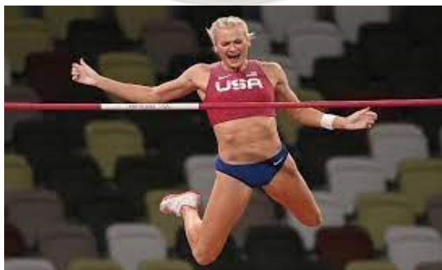
Olympic Gold Medalists Katie Moon, above, and Jenn Suhr, below are both past Winners of the Jersey Jumps Beach Vault! Jenn Set The Current Jersey Jumps Women's Record Of 15'1"!